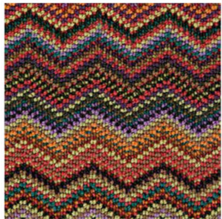
Fabulous Ruby, £154 per metre, Crucial Trading (020-7376 7100; www.crucial-trading.com )

Carpet has a history dating back 2,000 years (the world's most ancient pile carpet is the Pazyryk rug, dating back to the 4th or 5th century BC). Good news indeed that it now looks set to enjoy a fresh lease of life. ↗