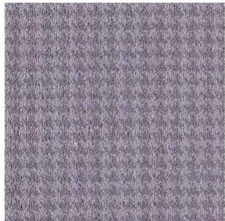
Houndstooth in heather, £69.99 per metre, Brintons (01562 635665; www.brintons.net )